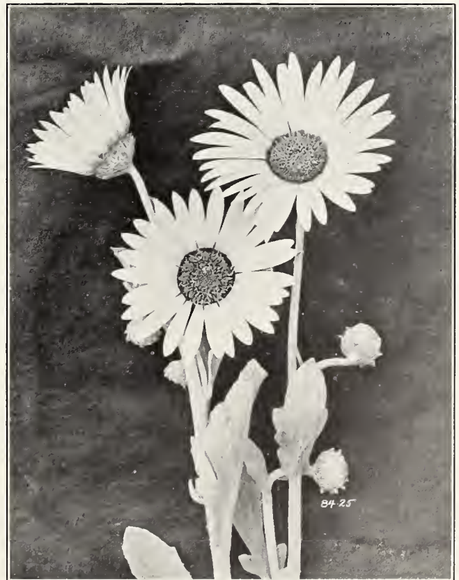
ARCTOTIS GRANDIS (AFRICAN LILAC DAISY)